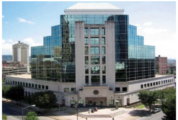
This decision comes from the United States District Court for the Northern District of Alabama located in the Hugo L. Black Courthouse (above) in Birmingham, Alabama.

Once again, FAIR and its legal arm, the Immigration Reform Law Institute (IRLI), were instrumental in bringing the challenge. IRLI filed an amicus brief in support of Rep. Brooks' challenge laying out legal arguments for why illegal aliens should