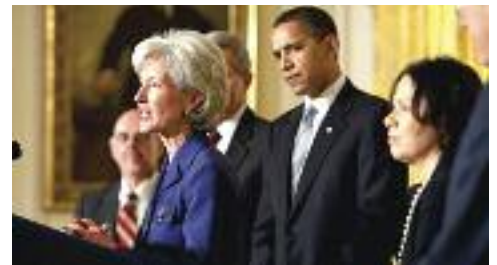
Speaking to an immigration advocacy group, Sebelius assured the audience, “there will be continued access for undocumented.”

Advocates for illegal immigration have many reasons for wanting amnesty for illegal aliens. Secretary of Health and Human Services Kathleen Sebelius has another, very expensive, one: To make millions of illegal aliens eligible for taxpayer subsidized health care coverage under Obamacare.