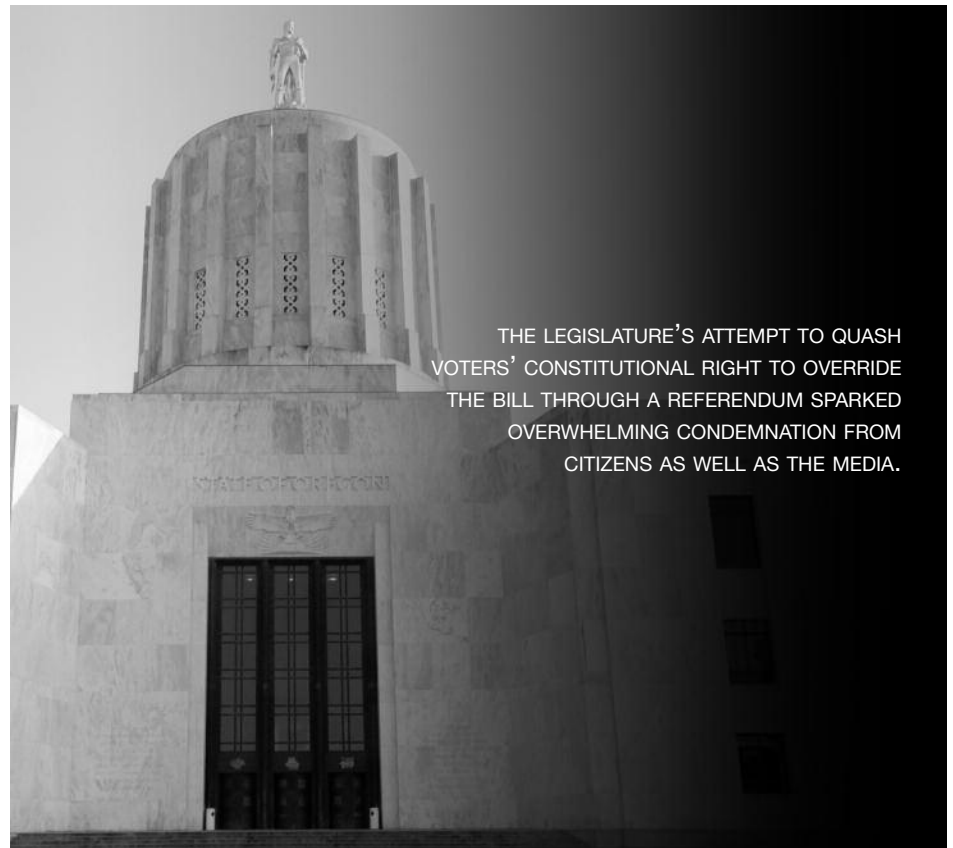
THE LEGISLATURE'S ATTEMPT TO QUASH VOTERS' CONSTITUTIONAL RIGHT TO OVERRIDE THE BILL THROUGH A REFERENDUM SPARKED OVERWHELMING CONDEMNATION FROM CITIZENS AS WELL AS THE MEDIA.

FAIR congratulates PODL and Oregonians for Immigration Reform for getting Referendum 301 on the November ballot and for their valiant efforts to resist the Legislature's attempt to hijack the referendum and the democratic process.