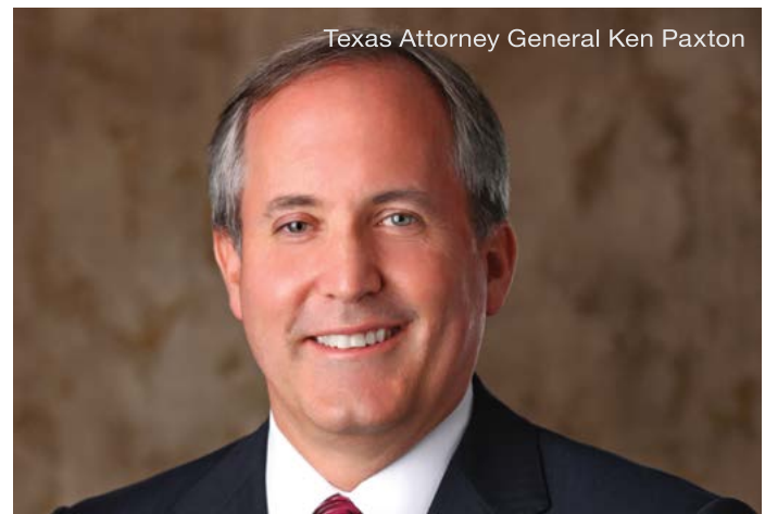
Texas Attorney General Ken Paxton

Of course, the biggest problem is that no one with the legal standing to do so challenged the DACA programs when it was first created in 2012. Two subsequent unconstitutional deferred action programs announced