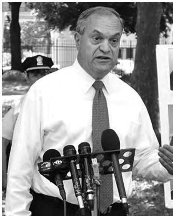
NEW HAVEN MAYOR JOHN DESTAFANO JR.

The city of New Haven already offers illegal aliens special identification documents that make it easier for them to live, work and bank in the city. Now, Mayor John DeStefano Jr. wants to allow them to vote in municipal elections. Under a proposal by the mayor, non-citizens, including illegal aliens, would have an equal voice with U.S. citizens in city elections. Connecticut's constitution clearly establishes U.S. citizenship as a requirement to vote in the state. However, Mayor DeStefano is asking the Connecticut Legislature to approve special legislation that would allow non-citizen voting in local elections. The idea was met by less than enthusiastic support from Gov. Dannel Malloy, who signed a bill in 2011 granting in-state tuition benefits to illegal aliens. While the governor said he "is not inclined to support" the idea, he nevertheless expressed willingness to "hear the mayor out on it."