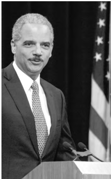
ATTORNEY GENERAL ERIC HOLDER

UTAH ENACTED TWO ADDITIONAL LAWS THAT DEFY FEDERAL IMMIGRATION AUTHORITY, BUT SUPPORT OBAMA ADMINISTRATION'S POLITICAL OBJECTIVE OF AMNESTY FOR ILLEGAL ALIENS AND INCREASED IMMIGRATION.